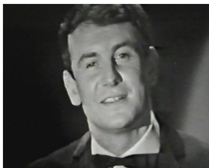
Butch Moore, Screenshot of the Eurovision Song Contest 1965

Also with the leading group was Butch Moore (North Dublin WSC, limit man), born James Augustine Moore, a 17-year-old back-stroke practitioner from Finglas, who was in 3 rd place at O'Connell Street Bridge when he got cramp which put him out of the prize winning group, although he managed to finish. 103,106 He would go on to have a career as a show-band icon in the 1960's. His big break came with the Capitol Showband in 1958 and as its lead singer he became one of the most popular Irish showband vocalists.